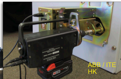
ABB / ITE HK

Remote Solutions eliminates the challenges of a clumsy, stationary, remote circuit breaker racking system. Protect your people and your assets with a compact, portable, scalable, and universal solution. The research, design, and build all happen in-house in our state-of-the-art facility in Tucson, Arizona.