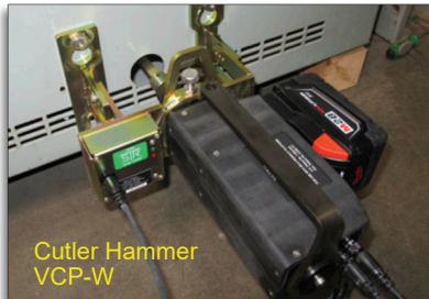
Cutler Hammer VCP-W