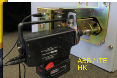
ABB / ITE HK

Remote Solutions eliminates the challenges of a clumsy, stationary, remote circuit breaker racking system. Protect your people and your assets with a compact, portable, scalable, and universal solution. The research, design, and build all happen in-house in our state-of-the-art facility in Tucson, Arizona.