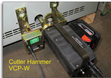
Cutler Hammer VCP-W