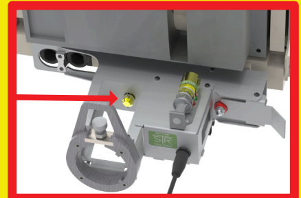
ITAA ENGAGED WITH RACKING PORT (USE ASSIST TOOL TO ACCESS ITAA IF NEEDED)