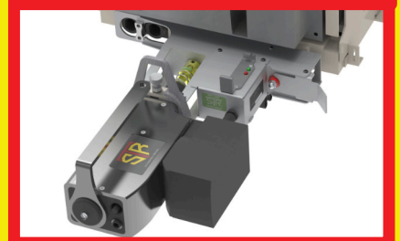
MDU WITH ATTACHED TAA (TOP) AND MDU/TAA PROPERLY ENGAGED WITH ITAA, DRIVE RINGS, AND LOCKING PIN - READY FOR SDB AND HHC COMMUNICATION CABLES

*Note: Multiple cables can be used to increase safe distance from breaker. Additional cables sold separately. Contact Remote Solutions LLC for more information.