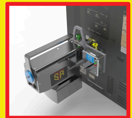
MDU WITH ATTACHED TAA PROPERLY ENGAGED WITH DRIVE RINGS AND LOCKING PIN, READY FOR SDB AND HHC COMMUNICATION CORDS

*Note: Multiple cables can be used to increase safe distance from breaker. Additional cables sold separately. Contact Remote Solutions LLC for more information.