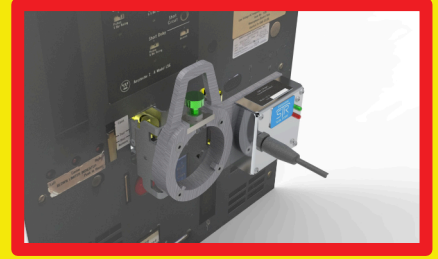
SDB SUSPENDED FROM CUBICLE FACE

2475 N. Jackrabbit Avenue · Tucson, AZ 85745 (520) 628-4378 · FAX (520) 628-4568 · sales@Safe-T-Rack.com · www.Safe-T-Rack.com