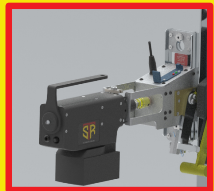
MDU WITH ATTACHED TAA ENGAGED WITH DRIVE RINGS AND LOCKING PIN, READY FOR SDB AND HHC COMMUNICATION CORDS