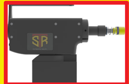
MDU WITH ATTACHED TAA