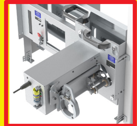
SDB SUSPENDED ON SPANNER BAR