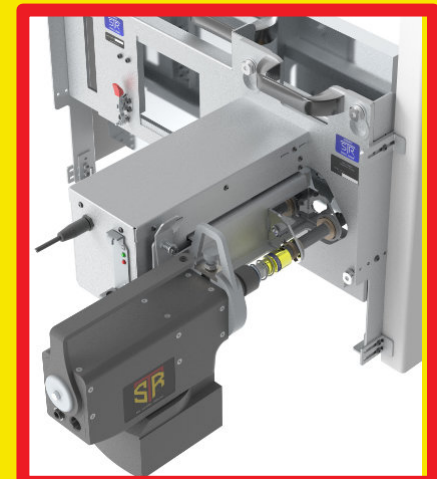
MDU WITH ATTACHED TAA PROPERLY ENGAGED WITH DRIVE RINGS AND LOCKING PIN, READY FOR SDB AND HHC COMMUNICATION CORDS

*Note: Multiple cables can be used to increase safe distance from breaker. Additional cables sold separately. Contact Remote Solutions LLC for more information.