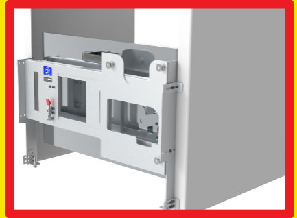
SPANNER BAR PLACED ACROSS BREAKER FACE

2475 N. Jackrabbit Avenue · Tucson, AZ 85745 (520) 628-4378 · FAX (520) 628-4568 · sales@Safe-T-Rack.com · www.Safe-T-Rack.com