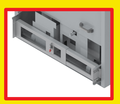
SPANNER BAR PLACED ACROSS CUBICLE WITH LOCKING CLAMPS ENGAGED TO HOLD IT IN PLACE