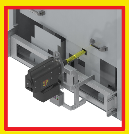
MDU WITH ATTACHED TAA PROPERLY ENGAGED WITH DRIVE RINGS AND LOCKING PIN, READY FOR SDB AND HHC COMMUNICATION CORDS

*Note: Multiple cables can be used to increase safe distance from breaker. Additional cables sold separately. Contact Remote Solutions LLC for more information.