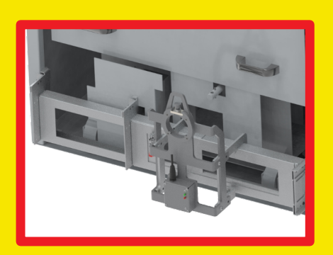
SDB SUSPENDED FROM SPANNER BAR AND ALIGNED WITH RACKING PORT