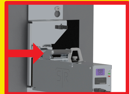
FORWARD ASSIST SPRING ASSEMBLY SECURING SDB IN PLACE AGAINST CUBICLE