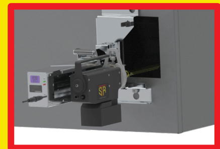
MDU WITH ATTACHED TAA PROPERLY ENGAGED WITH DRIVE RINGS AND LOCKING PIN, READY FOR SDB AND HHC COMMUNICATION CORDS

*Note: Multiple cables can be used to increase safe distance from breaker. Additional cables sold separately. Contact Remote Solutions LLC for more information.