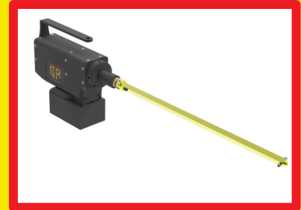
MDU WITH ATTACHED TAA