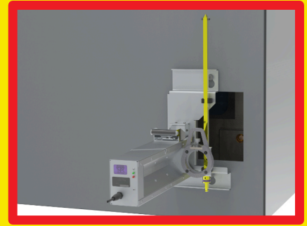
SDB SUSPENDED FROM CUBICLE USING CUBICLE KIT SHOULDER NUTS

2475 N. Jackrabbit Avenue · Tucson, AZ 85745 (520) 628-4378 · FAX (520) 628-4568 · sales@Safe-T-Rack.com · www.Safe-T-Rack.com