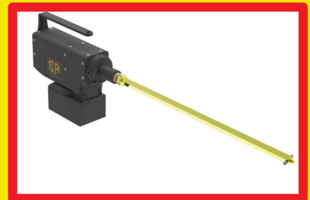
MDU WITH ATTACHED TAA