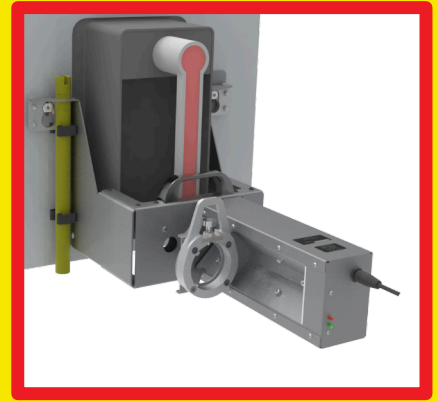
SDB SUSPENDED FROM BREAKER USING SHOULDER NUTS

2475 N. Jackrabbit Avenue · Tucson, AZ 85745 (520) 628-4378 · FAX (520) 628-4568 · sales@Safe-T-Rack.com · www.Safe-T-Rack.com