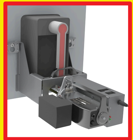
MDU WITH ATTACHED TAA ENGAGED WITH DRIVE RINGS AND LOCKING PIN, READY FOR SDB AND HHC COMMUNICATION CORDS

*Note: Multiple cables can be used to increase safe distance from breaker. Additional cables sold separately. Contact Remote Solutions LLC for more information.