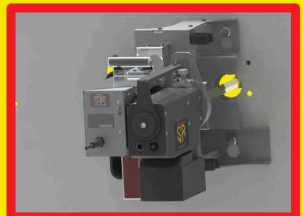
MDU WITH ATTACHED TAA ENGAGED WITH DRIVE RINGS AND LOCKING PIN, READY FOR SDB AND HHC COMMUNICATION CORDS

*Note: Multiple cables can be used to increase safe distance from breaker. Additional cables sold separately. Contact Remote Solutions LLC for more information.