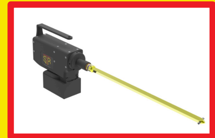
MDU WITH ATTACHED TAA