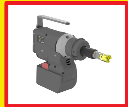
MDU WITH ATTACHED TAA