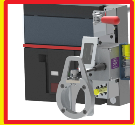
SDB SUSPENDED FROM BREAKER USING MANUAL RACKING TOOL PORT WITH TOGGLE CLAMP ENGAGED.