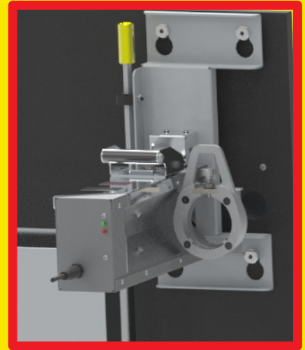
SDB SUSPENDED FROM CUBICLE USING CUBICLE KIT SHOULDER NUTS