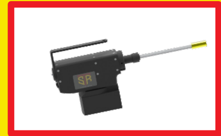
MDU WITH ATTACHED TA