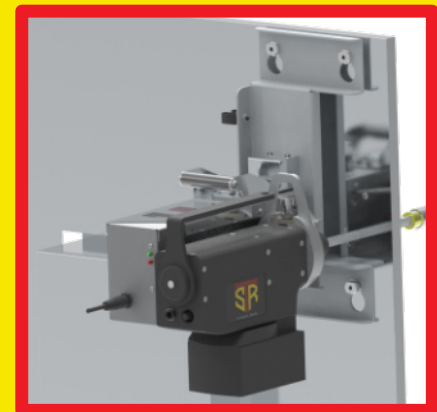
MDU WITH ATTACHED TA ENGAGED WITH DRIVE RINGS AND LOCKING PIN, READY FOR SDB AND HHC COMMUNICATION CORDS

*Note: Multiple cables can be used to increase safe distance from breaker. Additional cables sold separately. Contact Remote Solutions LLC for more information.