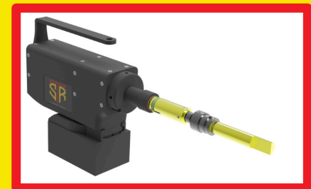
MDU WITH ATTACHED TAA