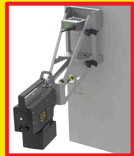
MDU WITH ATTACHED TAA - ENGAGED WITH DRIVE RINGS AND LOCKING PIN, READY FOR SDB AND HHC COMMUNICATION CABLES