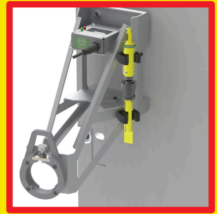
SDB SUSPENDED FROM CUBICLE KIT SHOULDER NUTS