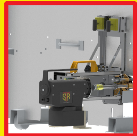
MDU WITH ATTACHED TAA ENGAGED WITH DRIVE RINGS AND LOCKING PIN, READY FOR SDB AND HHC COMMUNICATION CORDS

*Note: Multiple cables can be used to increase safe distance from breaker. Additional cables sold separately. Contact Remote Solutions LLC for more information.