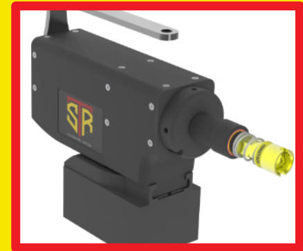
MDU WITH ATTACHED TAA