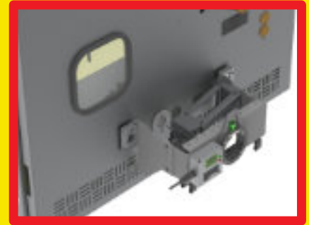
SDB SUSPENDED FROM CUBICLE USING CUBICLE KIT SHOULDER NUTS