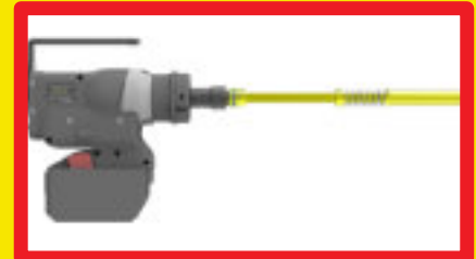
MDU WITH ATTACHED TAA