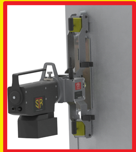
MDU WITH ATTACHED TAA PROPERLY ENGAGED WITH DRIVE RINGS AND LOCKING PIN, READY FOR SDB AND HHC COMMUNICATION CORDS