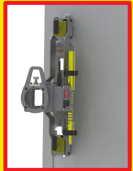
SDB PLACED AGAINST CUBICLE FACE, DRIVE RINGS ALIGNED WITH RACKING SHAFT AND MAGNETS LOCKED