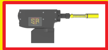
MDU WITH ATTACHED TAA