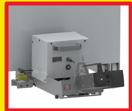
MDU WITH ATTACHED TAA ENGAGED WITH DRIVE RINGS AND LOCKING PIN, READY FOR SDB AND HHC COMMUNICATION CORDS