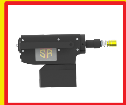
MDU WITH ATTACHED TAA