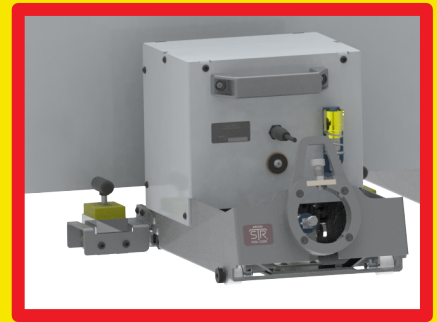
SDB PLACED CORRECTLY AGAINST CUBICLE AND SECURED WITH SWITCHING MAGNETS