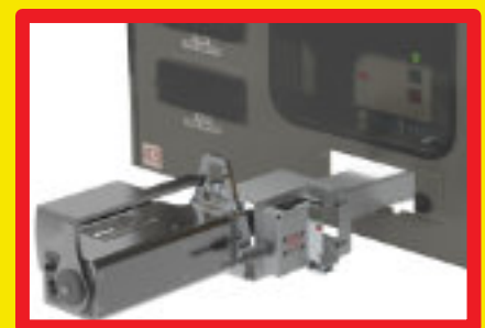
MDU WITH ATTACHED TAA ENGAGED WITH DRIVE RINGS, READY FOR SDB AND HHC COMMUNICATION CABLES