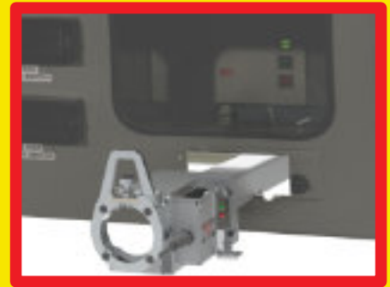
SDB SECURED AGAINST BREAKER USING MOUNTING TEETH