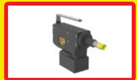
MDU WITH ATTACHED TAA