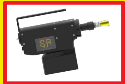
MDU WITH ATTACHED TA