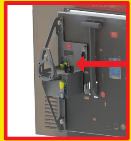
SDB SUSPENDED FROM SHOULDER BOLTS; ITA INSERTED INTO RACKING PORT