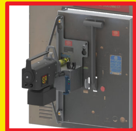
MDU WITH ATTACHED TA ENGAGED WITH DRIVE RINGS, AND LOCKING PIN - READY FOR SDB AND HHC COMMUNICATION CABLES

*Note: Multiple cables can be used to increase safe distance from breaker. Additional cables sold separately. Contact Remote Solutions LLC for more information.